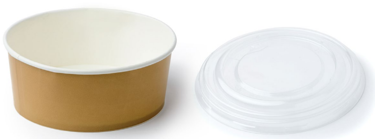
Kraft salad bowl & lid