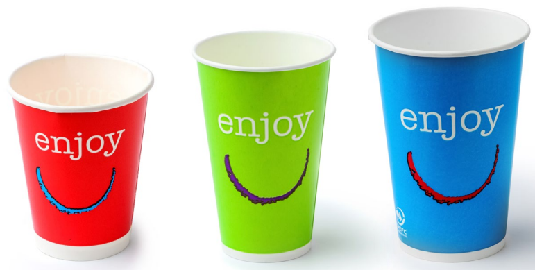
Enjoy cups available in mixed colours in a sleeve: 250 ml, 350 ml, 500 ml & 650 ml.

We wish all our customers and suppliers, as well as their staff and ours, a peaceful, safe and enjoyable festive season and a happy new year!